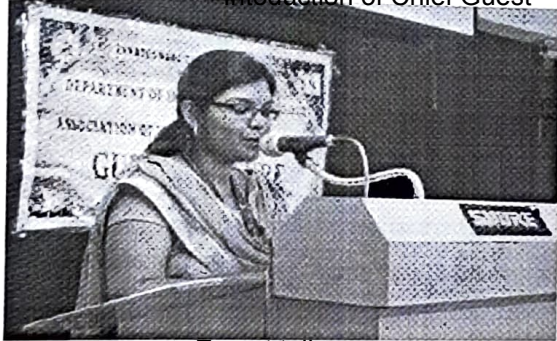
Intoduction of Chief Guest