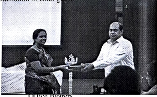
Felicitatoin of chief guest