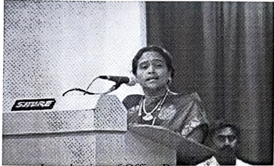
Short note by HOD